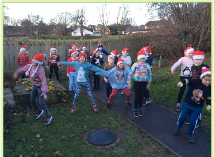
Not quite dashing through the snow, but the Santa Dash kept everyone moving on the cold mornings.